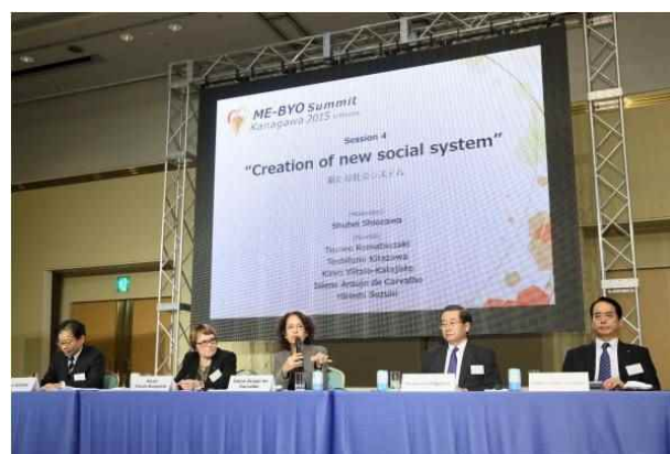
ME-BYO Summit Kanagawa 2015 in Hakone

In October 2015, the international symposium “ME-BYO Summit Kanagawa” was held to discuss ME-BYO from various perspectives such as advanced technologies and industrial applications, by inviting experts from a variety of fields including academia, the private sector, as well as organizations at home and abroad. On the basis of discussions during the summit, the “ME-BYO Summit Kanagawa Declaration” was adopted, which specified the future direction of initiatives, and disseminated the concept of “ME-BYO” to the world.