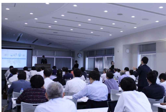
Association for ME-BYO Industry

In August 2014, the “Association for ME-BYO Industry” composed of members from a wide variety of industries and others related to “ME-BYO” was established to serve as a forum for consultation and best practices to solve problems in creating the ME-BYO Industry. The association aims to extend the healthy longevity of the people of Japan and revitalize Japan’s economy by creating a new industry, the “ME-BYO Industry”, which could become a growth industry in the super-aging society, utilizing initiatives such as National Strategic Special Zones. It also aims to create a new healthcare system and extend these activities both domestically and overseas.