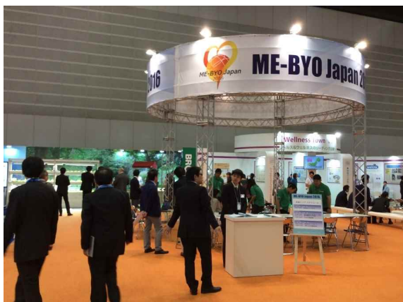
ME-BYO Japan 2016

To expand markets related to the ME-BYO Industry, the prefecture will promote efforts to further popularize ME-BYO-related products and services among the people of Kanagawa, and proactively approach overseas markets that are expected to have a great demand, thereby expanding international business opportunities.