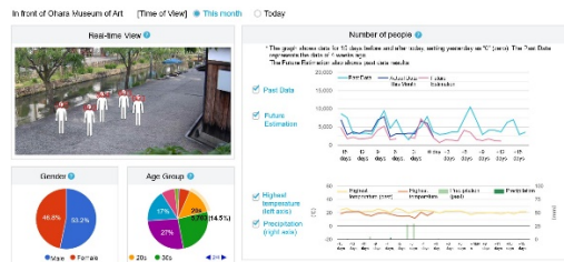
People-Flow Now in Kurashiki Bikan Historical Quarter