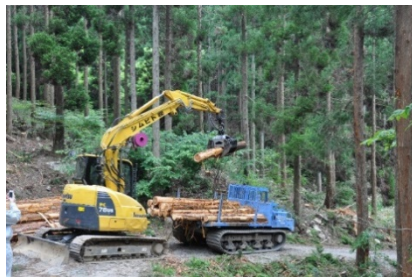
100-Year Vision for Forests project