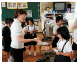
ALT teaching at an elementary school

There are now 52,000 former JET participants present in 54 countries. The JET Alumni Association boasts 51 chapters around the globe. These networks foster ongoing ties between Japanese regions and many other countries.