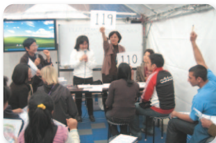
Lecture on disaster prevention for foreign residents

We encourage cooperation amongst international exchange associations throughout Japan. In addition, CLAIR and the Japan NGO Center for International Cooperation (JANIC) jointly operate the Citizens' International Plaza to promote collaboration between local governments and internationally-oriented community groups: NGOs, NPOs, etc.