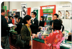
Support to local governments exhibiting at the International Restaurant and Foodservice Show of New York