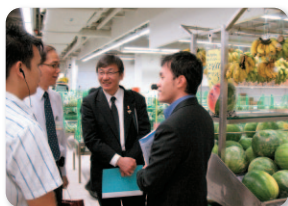
Supporting a local government during a market research

We investigate policy and practice overseas to provide guidance for actions taken by Japanese local governments. For example, our survey of smoking bans in foreign countries resulted in an ordinance to prevent secondhand smoking.