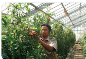
Trainee undergoing practical training in agriculture at host local government