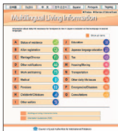
Multilingual living information website