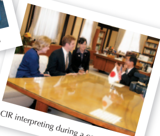
CIR interpreting during a courtesy call