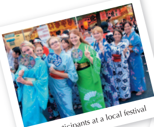
JET participants at a local festival