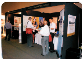
Disseminating information about Japanese local governments