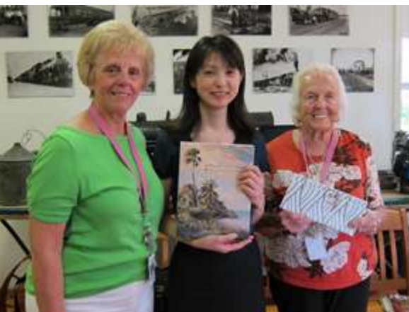
Citizen Budget Committee