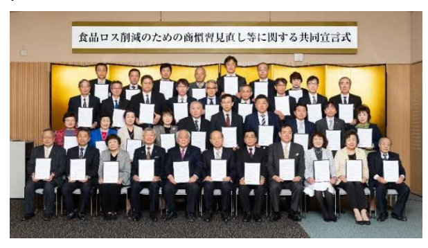
Conclusion of a joint agreement by members of the Prefectural Residents' Council

Expert Committee to Consider Business Practices established was under Residents' Prefectural Council and conducting discussions aimed at revising business practices such as the so-called "1/3" Rule". At the Prefectural Residents' Council meeting held in March 2019, it was agreed that businesses, consumers, and government bodies would collaborate together with prefectural residents all coming together as one to undertake the revision of business practices in order to reduce food loss.