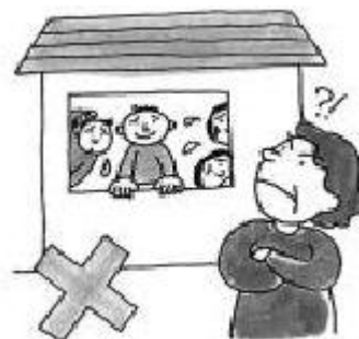
Subletting to other people