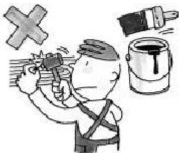
Nailing of paintings

You may not convert or remodel the housing, or let people other than your family live together, without permission of the landlord. You may not rent the part or the whole of the housing to other people, either.