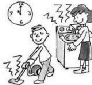
Sound of using vacuum cleaners and laundry machine