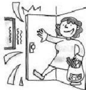
Opening and closing of doors