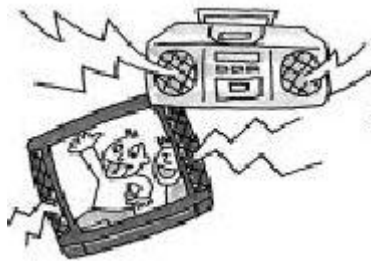
Sound from television set, radio, speakers, etc.

[Kinds of sound that can be taken as “noise”]