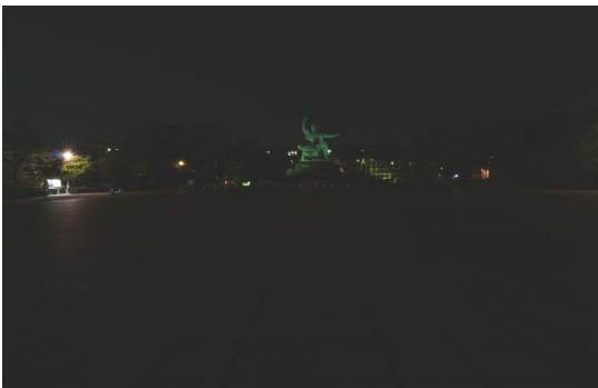
Peace Park (before light installation)