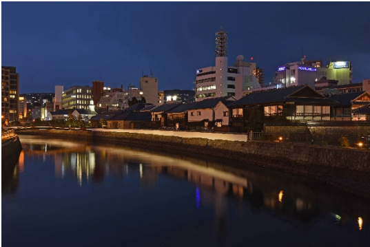
Night scenery of Dejima after light installation

establish axis lines that connect landmarks and tourist facilities within those areas, and promote the outfitting of lighting equipment to illuminate them.