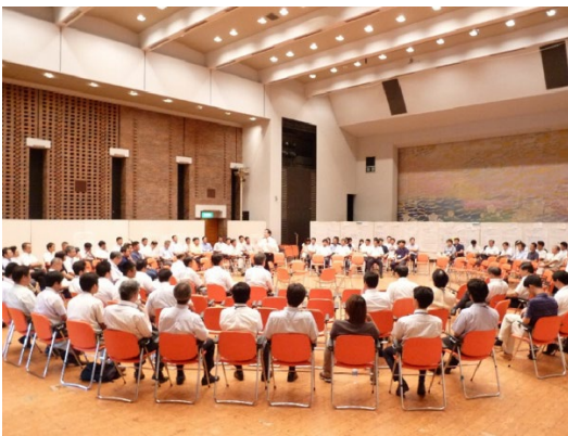
A meeting of city officials