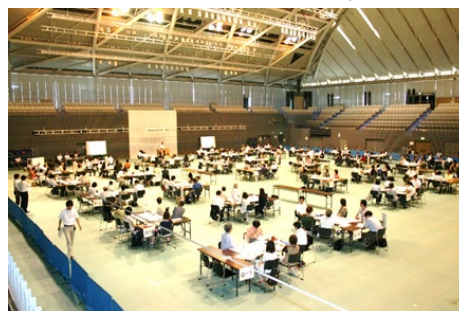
The Odawara TRY Forum in session

A new citizen participation method was brought in to uncover the opinions of the silent majority, by holding discussion forums for randomly selected citizens. 3,000 invitations were sent out, and 200 people agreed to participate. Opinions and ideas from ordinary citizens on 63 subjects from 8 fields were collected and reflected in the plan.