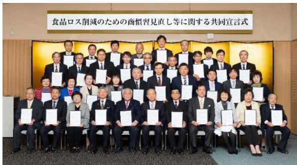
Conclusion of a joint agreement by members of the Prefectural Residents' Council