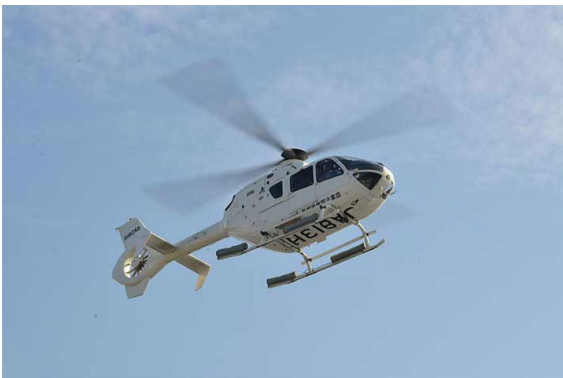
The Shimasuketto Group uses RIMCAS (Remote Island Medical Co-operation Air Service) to provide medical support

So far, four medical institutions and 39 physicians from within and outside the prefecture have registered. In FY2021, physicians were dispatched to four clinics for a total of 77 days of treatment.